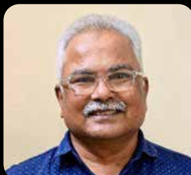
Mr. Bernard Shaw